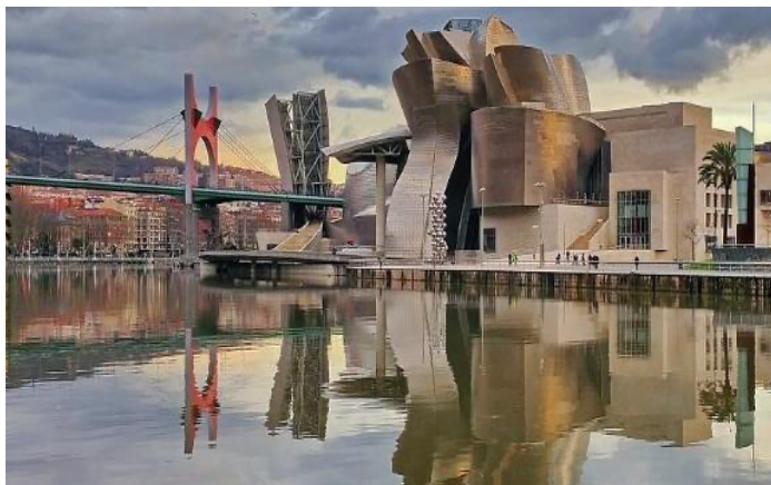
GUGGENHEIM MUSEUM, BILBAO