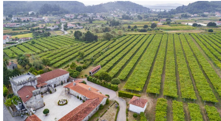
PAZO TORRE PENELAS, FAMILIA TORRES ESTATE IN GALICIA