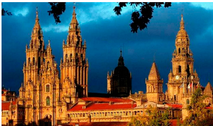
SANTIAGO DE COMPOSTELA CATHEDRAL

Wednesday, June 10: Group transportation from Bilbao airport to San Sebastian. Check-in at Hotel María Cristina for 3 nights, in time for welcome dinner.