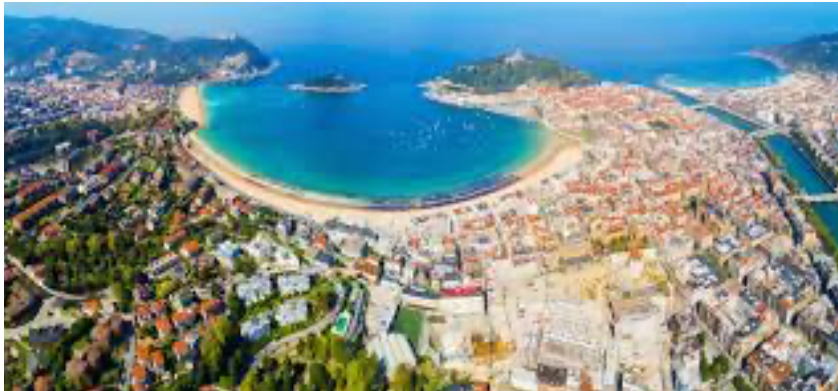
LA CONCHA BEACH, SAN SEBASTIAN