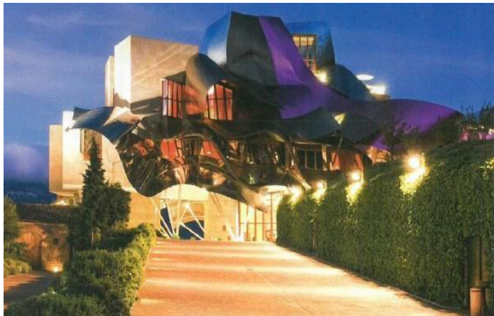
MARQUES DE RISCAL WINERY, LA RIOJA